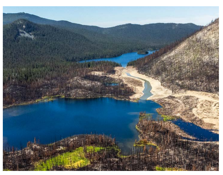
Lake 15/16 connector

The Environment team is planning to plant natural vegetation alongside the connector and conducting reclamation trials. They are working with local First Nations to identify which specific plant species are of concern to the Nations and to understand what they would like to see in the area once Blackwater Mine completes operations.