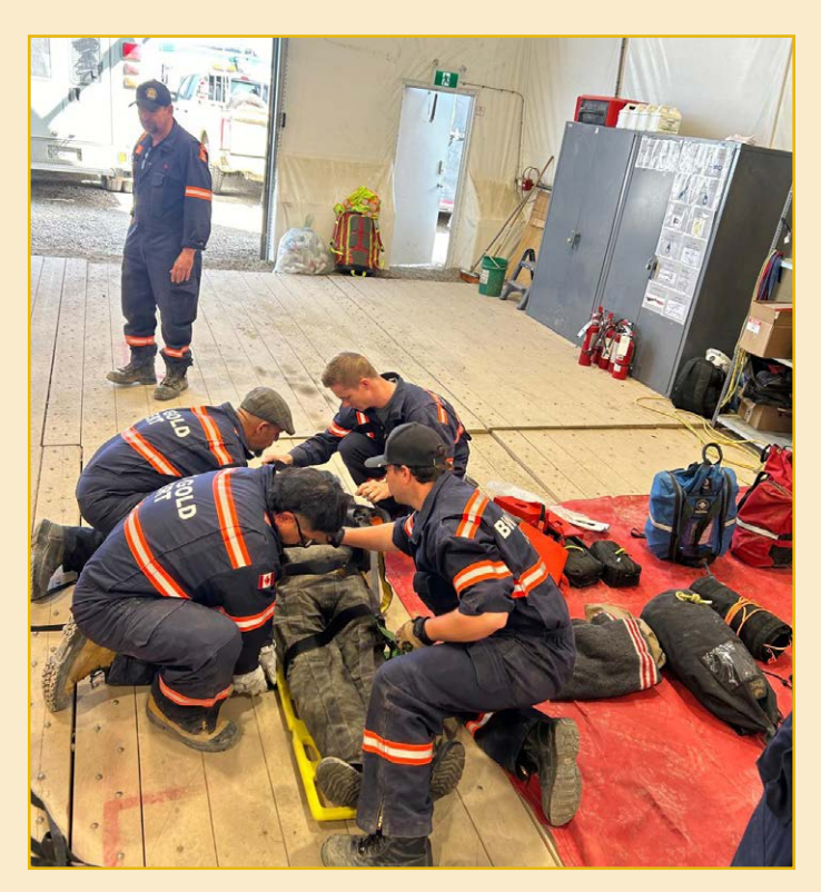
Mine Rescue Team training - July 2024

We have used proactive engineering measures and best practices to optimize our construction activities without compromising the environment along the transmission line. We are committed to ensuring that archaeological sites are protected and that we minimize our impact on the environment and wildlife along the route.