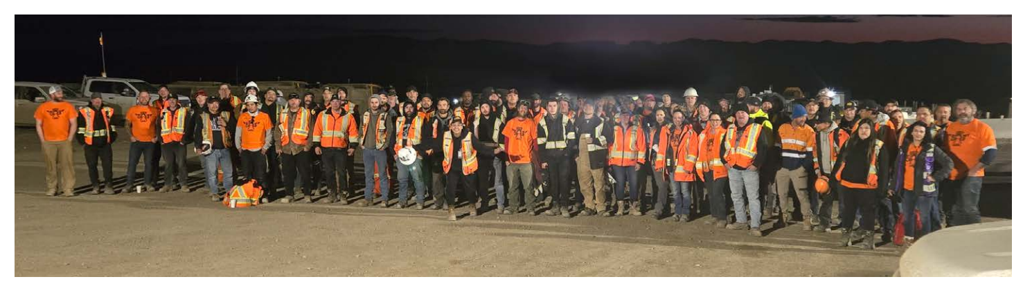
Blackwater Mine staff and contractors mark the National Day for Truth and Reconciliation and Orange Shirt Day

Members of our Indigenous Relations, Community Relations, and Business Opportunities teams connected with community members this quarter.