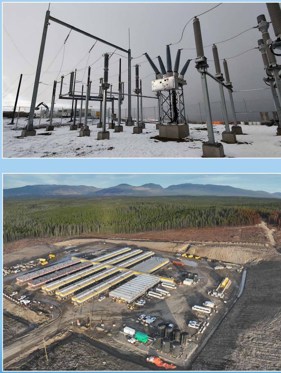
The 135-kilometre long 225kV transmission line between the Blackwater Mine and BC Hydro's Glenannan substation is complete and was successfully energized with renewable grid power on October 8, 2024.