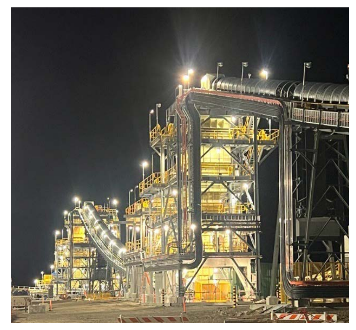
First ore was fed through the processing facility's crushing circuits in November 2024.