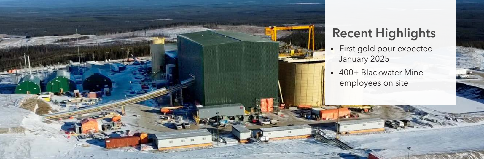
Blackwater Mine processing plant - November 2024