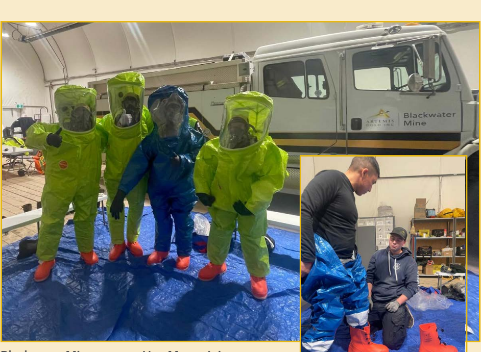
Blackwater Mine team at Haz-Mat training November 2024

At Artemis Gold and Blackwater Mine, safety is our top priority. Our Mine Rescue team participates in regular training exercises to build and reinforce their skills. In November, they participated in Hazardous Materials Training.