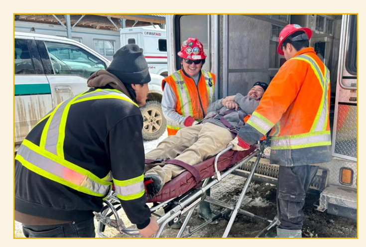
Blackwater Mine team members practising their skills

We recently held an Emergency Response Training (ERT) session which focussed on ambulance skills - loading/unloading a patient onto a stretcher, transferring a patient to a backboard, loading a patient into an ambulance and working with the ambulance's medical supplies. The group appreciated the team-building opportunity and the chance to reinforce their mine rescue skills.