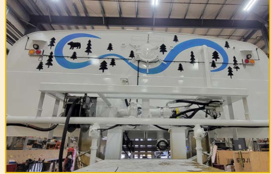
Water Tank features Ulkatcho and Lhoosk'uz Dené First Nations' logos and artwork.