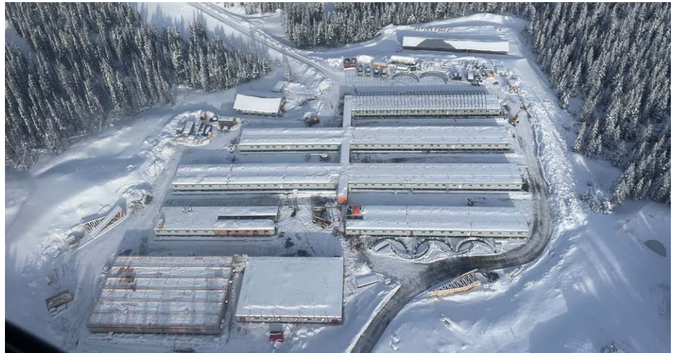
Q1 2023, Top: Blackwater Mine Plant Site; Bottom: New Construction Camp area