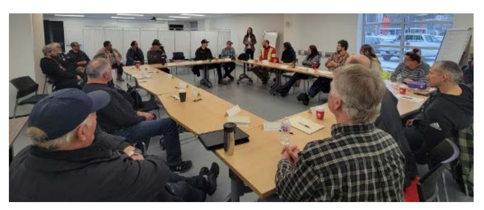
Meeting with students at the Class 1 Driver Session, College of New Caledonia