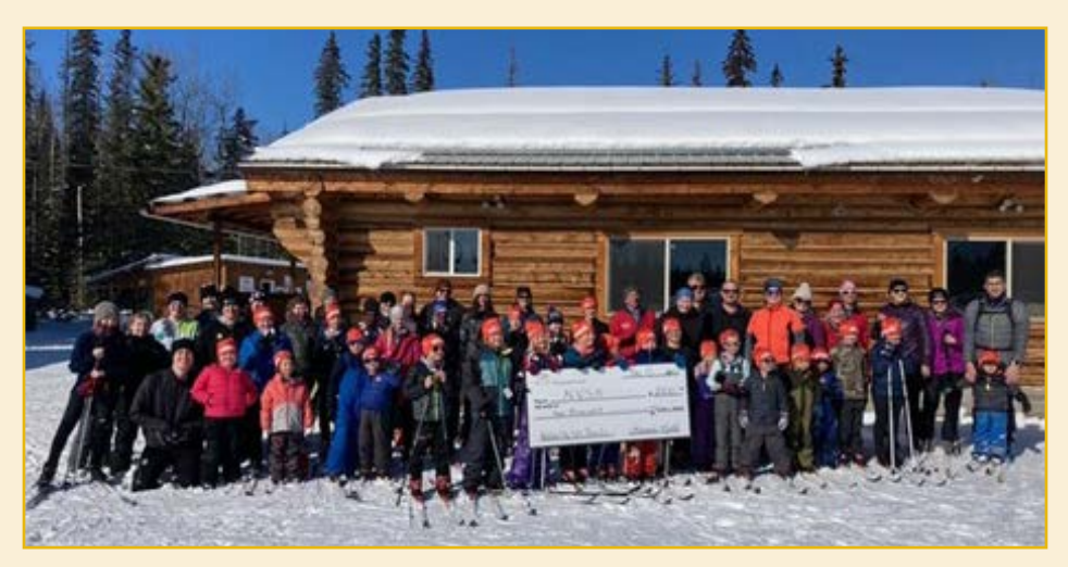
Artemis Gold cheque presentation to the Nechako Valley Sporting Association

Any non-profit organization or interested party that would like to be considered as part of Artemis Gold's 2023 strategic social investment program can download the 2023 application form at artemisgoldinc.com/sponsorship. Please review the guidelines before applying to ensure your initiative is eligible.