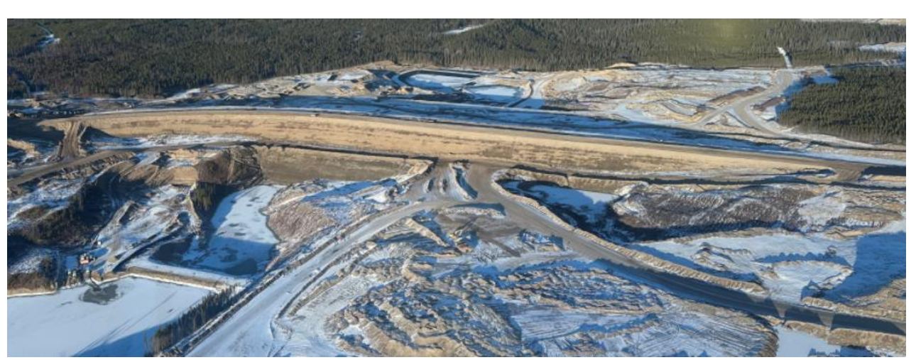
The tailings storage facility is complete for initial Phase 1 production